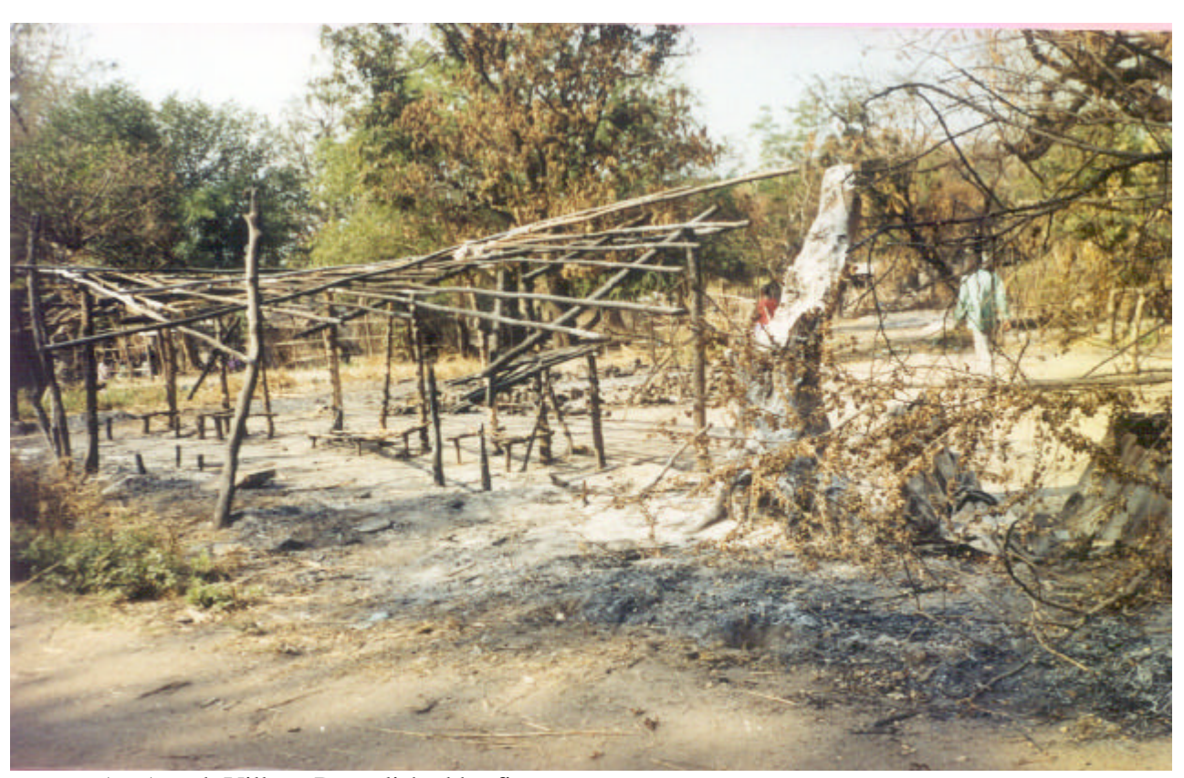
An Anuak Village Demolished by fire.